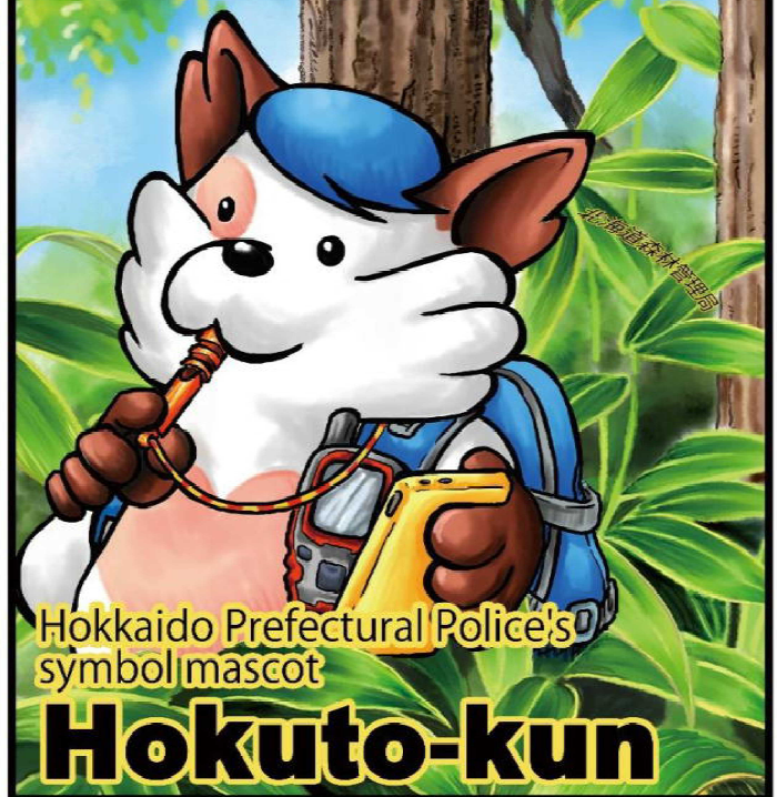
Hokkaido Prefectural Police's symbol mascot Hokuto-kun

Carry the three MUST-HAVE location-finding items mobile phone • GPS • whistle