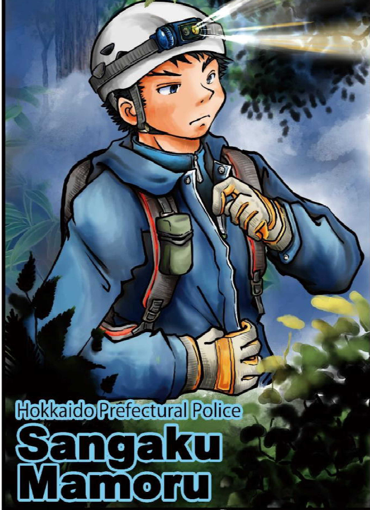
Hokkaido Prefectural Police Sangaku Mamoru

Emergency survival depends on you! Carry warm clothes and a headlight even for one-day hiking trips!!